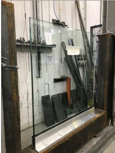
Photograph of the item