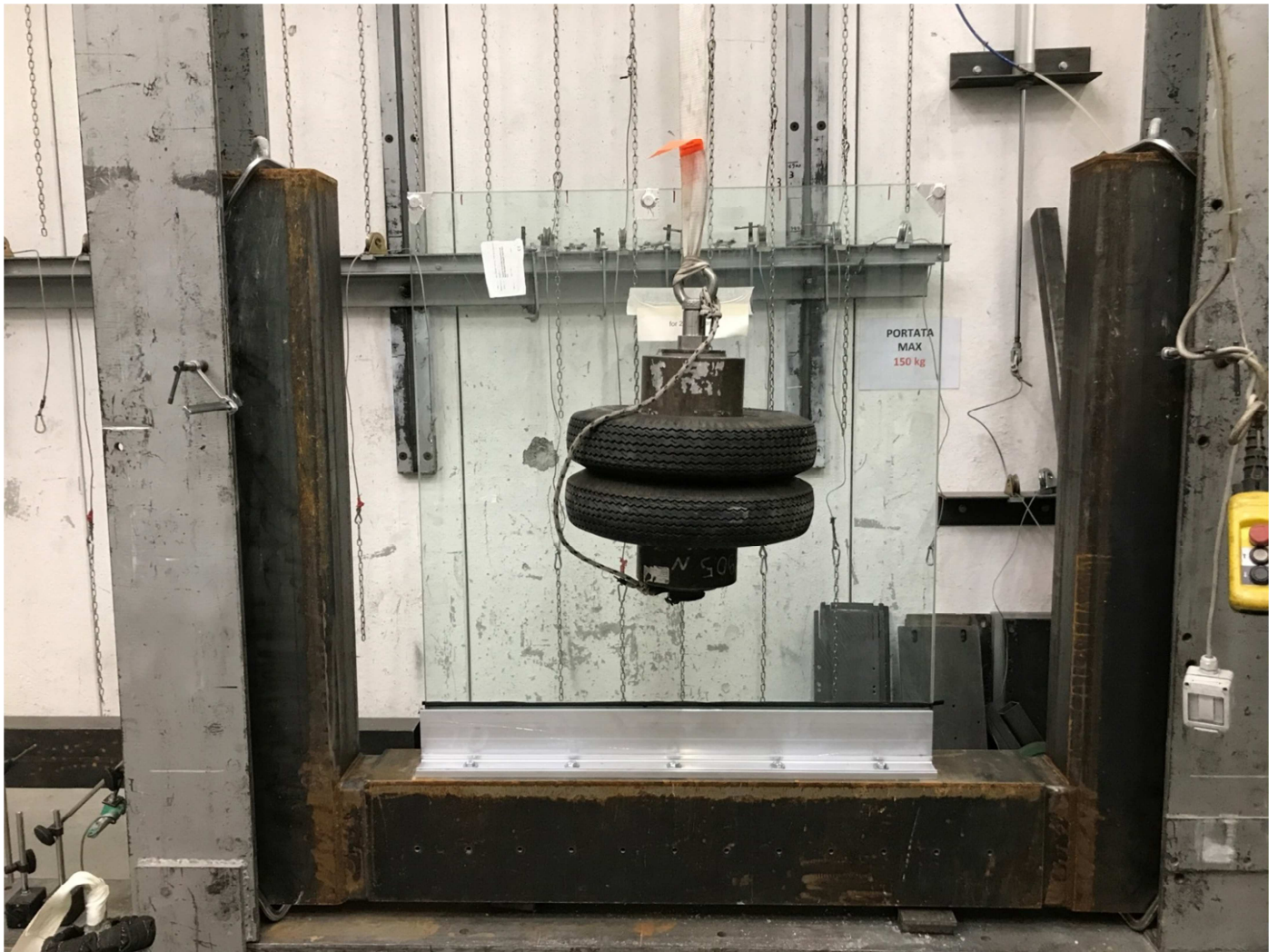
Photograph of the item after impact on the centre of the glazing according to standard UNI EN 14019:2016