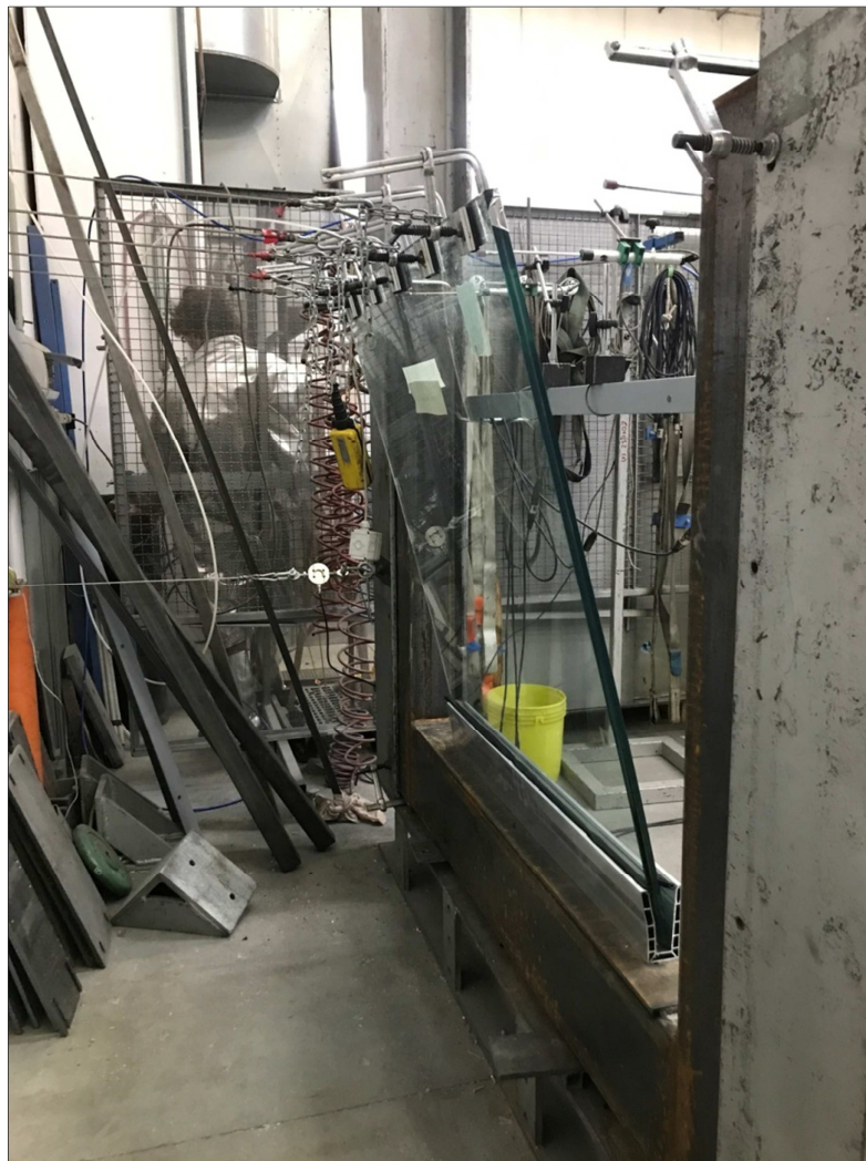
Photograph of the item undergoing horizontal linear static load (4 kN/m)