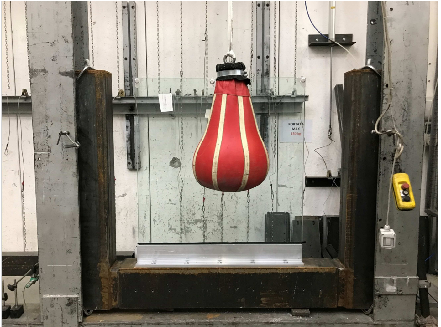
Photograph of the item after impact on the centre of the glazing according to standard NF P01-013:1988