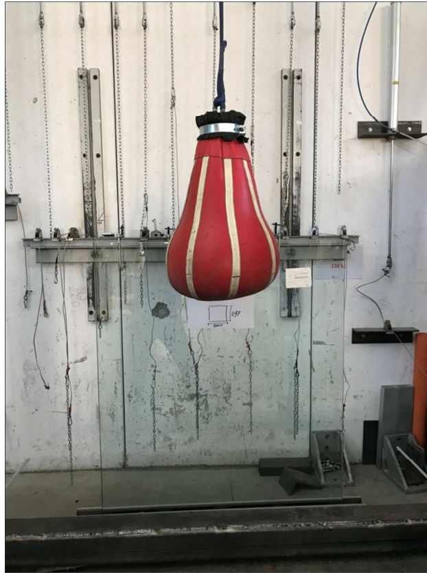
Photograph of the item after impact on the border of the glazing with dynamic load according to standard UNI 10807:1999