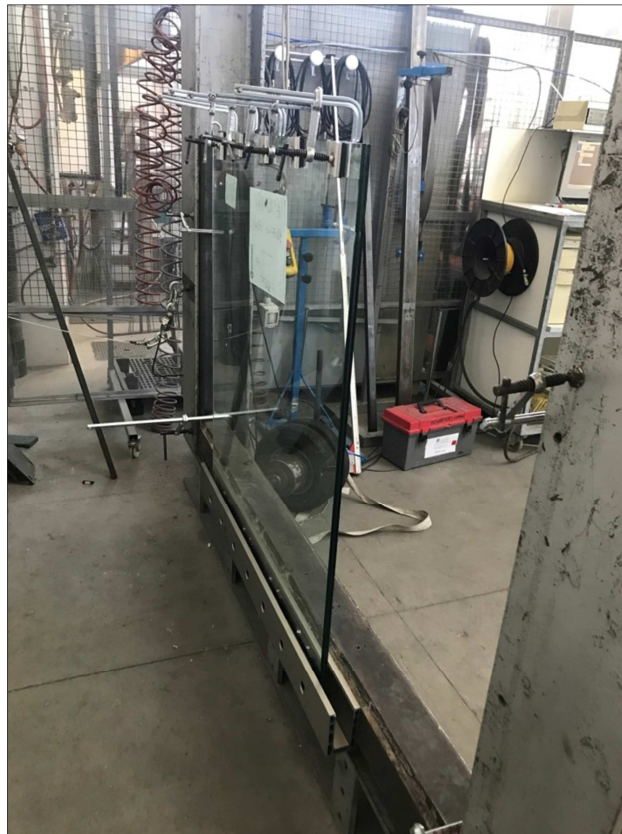
Photographs of the Item