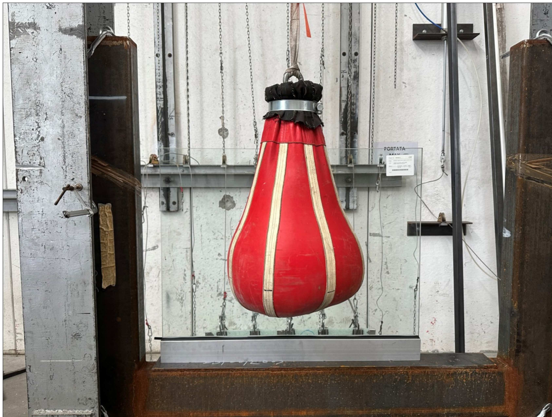
Photograph of the item after impact according to standard NF P01-013:1988