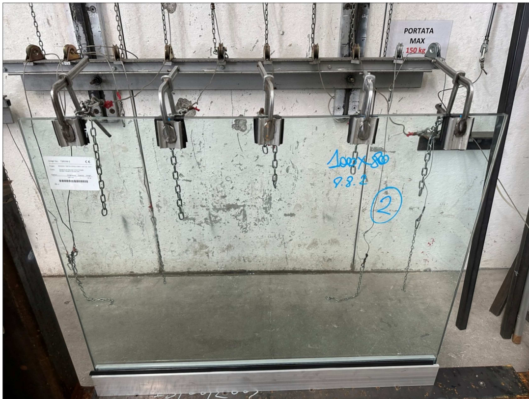
Photograph of the item

Further details of item specifications in annex "A".