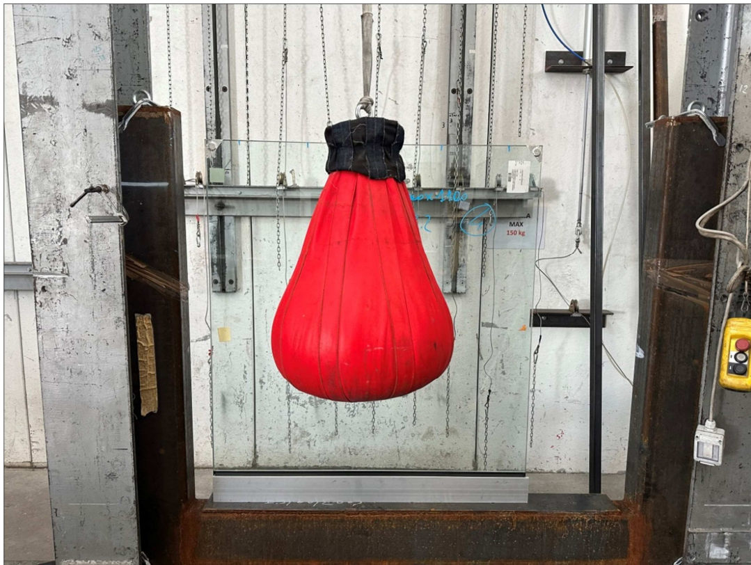
Photograph of the item after impact according to standard NF P01-013:1988