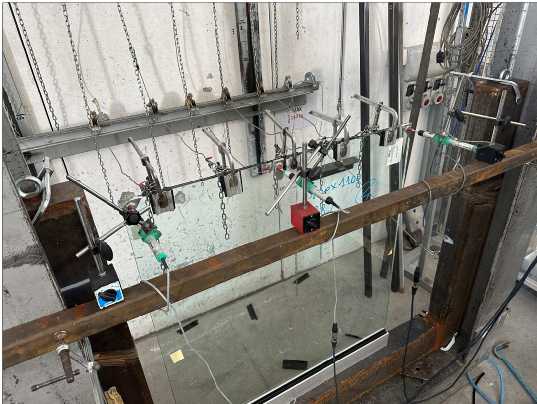
Photograph of the item

Further details of item specifications in annex "A".