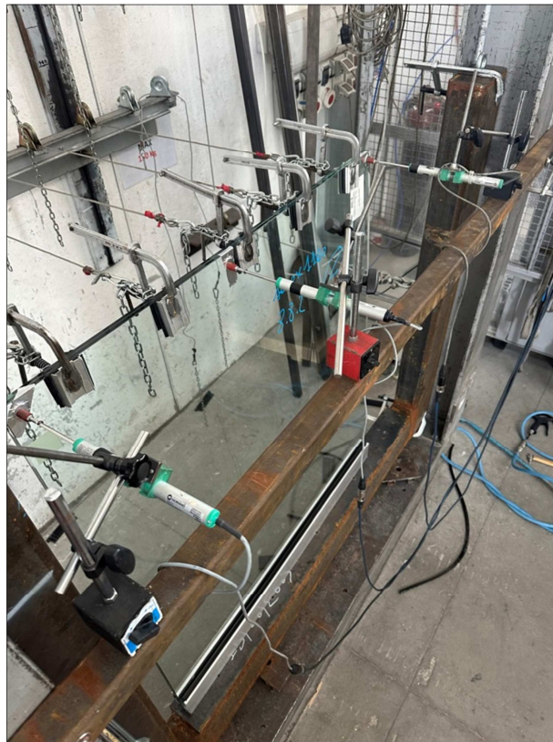
Photograph of the item undergoing horizontal linear static load