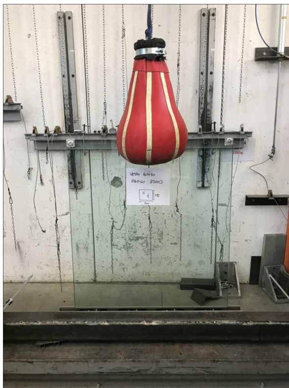
Photograph of the item after impact on the center of the glazing with dynamic load according to standard UNI 10807:1999