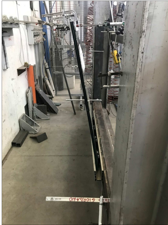
Photograph of the item undergoing horizontal linear static loading