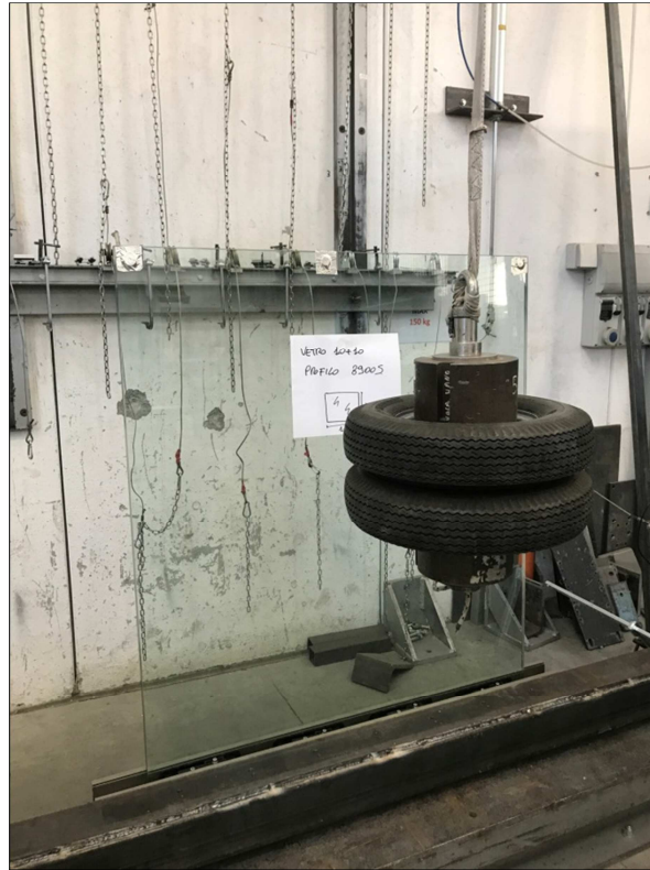
Photograph of the item after impact on the center of the glazing with dynamic load according to standard UNI EN 14019:2016